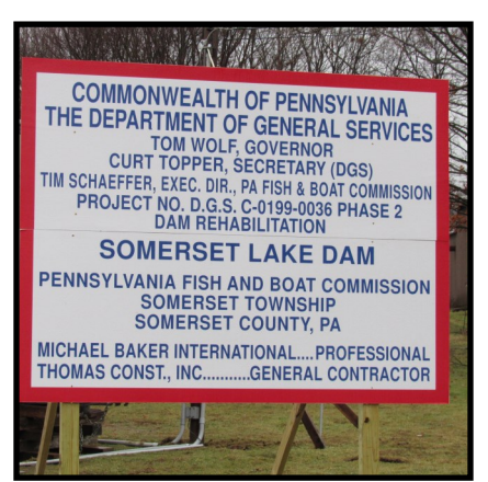
The reconstruction of Somerset Lake began in 2019

A final design from Hedin Environmental & initial construction of the Phase 2 project is anticipated in 2020.