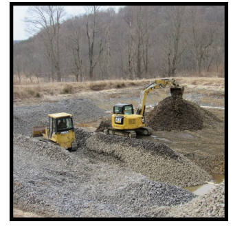
Rehab and reconstruction at Hawk View Oven Run Site F.

Also the District awarded a contract to Whitehorse Excavating LLC for the rehab of Oven Run Site F, also known as Hawk View, and owned by the Somerset County Conservancy. This project is expected to be completed in April 2020.