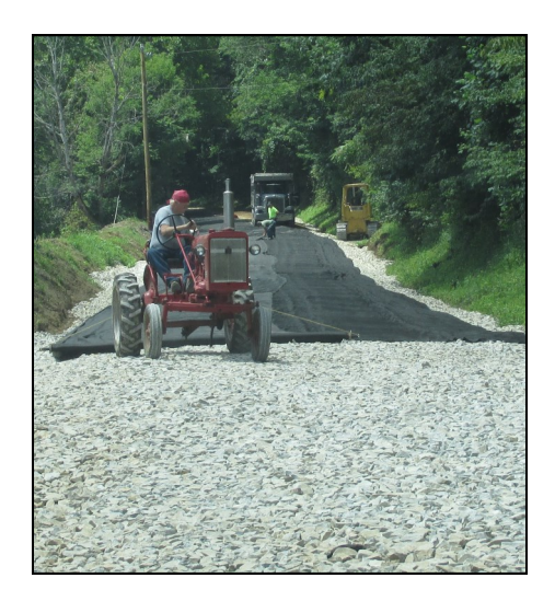
Dirt & Gravel Road Project Colflesh Road, Lower Turkeyfoot Township

Dirt & Gravel Road Project Davis Road, Elk Lick Township Cross Pipe & Road Fill Installation