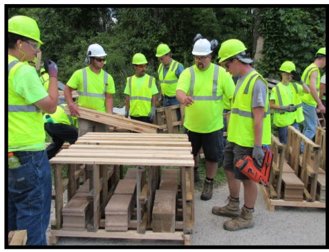
Volunteers construct fish habitat

The PA Fish and Boat Commission's Bureau of Habitat Management Lake Division designs and oversees the construction and placement of the structures. The Cambria-Somerset Authority provides support and Shaffer Block of Somerset provides material for the project. Volunteers from the District, Somerset County Sportsmen's League, Jenner Rod and Gun Club, Berlin-Brothersvalley High School, the maintenance students structures from the Commonwealth Technical Institute of the Hiram G. Andrews Center, and the Stonycreek-Conemaugh River Improvement Project (SCRIP) provide the hands-on work to construct the structures.