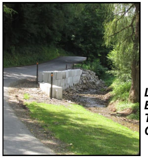
Low Volume Road Project Brehm Road, Jenner Township Completed Retaining Wall

To review the DGLVR Program, the Administration Guidelines, the Environmentally Sensitive Maintenance (ESM) procedures, and other aspects of the program go to www.dirtandgravel.psu.edu.